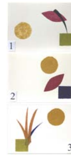
Cards More news overleaf.

Cards, gifts & prints for under £100 - this page will be added to on a regular basis and offers a range of unique cards and gift ideas. I hope you will visit this new page often to find something inspirational and out of the ordinary. All the items are hand made/printed by us and vary from cards, model making and prints: something for all age groups to enjoy.